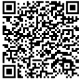
Diploma in Managing Customer Relationships

Scan the QR codes to read the Co-Op Policies.