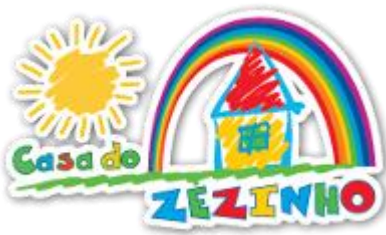
Casa De Zezinho (Brazil)